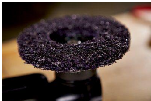
Silicon carbide mineral in a reengineered nylon web