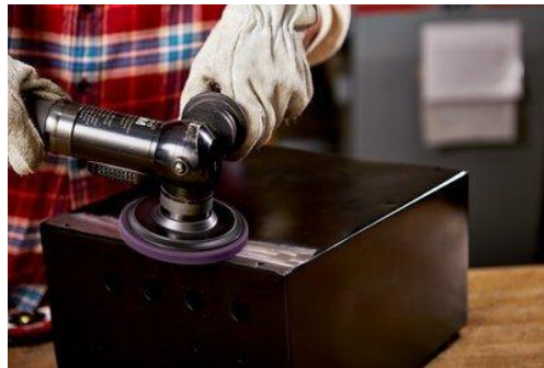
High-strength fiber performs well on edges

With its reengineered fiber, the Scotch-Brite™ Clean and Strip XT Pro Disc allows operators to take advantage of all the benefits that come with increased conformability without compromising strength. With increased conformability, this disc achieves a larger contact area with the workpiece for faster removal rates. It also conforms to weld bead ripples to polish welds without removing them, and works in hard-to-reach areas without damaging the substrate.